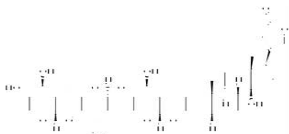
Figure.3. Chemical Structure of Digoxin

Digoxin is a potent cardiac glycoside that is derived from Foxglove plant ( Digitalis purpurea ). Digitalis was earlier used to treat Dropsy which is an old term for Edema. Now the subsequent investigation has found that digitalis is most useful for edema that was caused by a weakened heart.